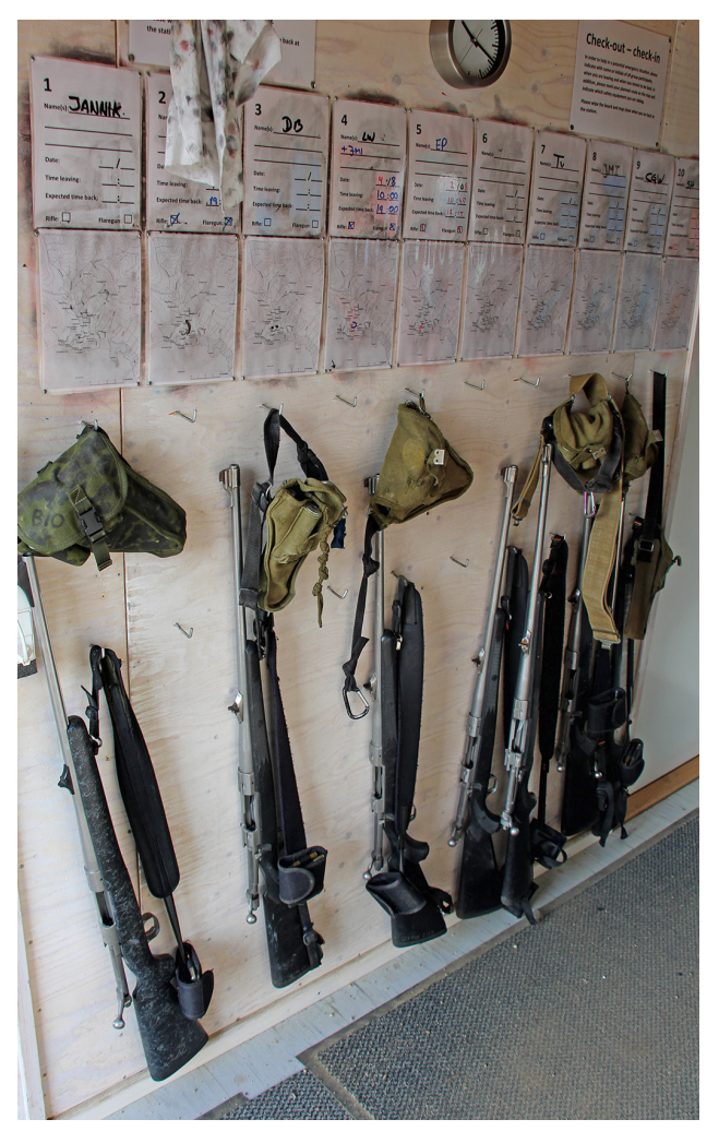
All guests will get an introduction to safety guidelines and weapons upon arrival. Photo of Logbook and weapons in house 5.