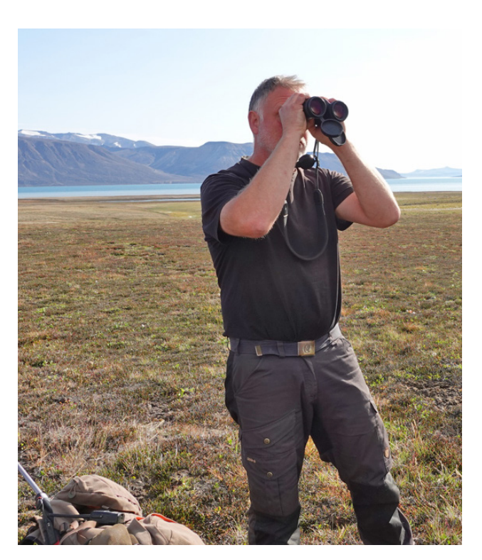
Bring GPS and binoculars for safety.

Once at the Reykjavik airport, you must check in your luggage again – even though it should be labelled with Akureyri as your final destination. The flight Reykjavik – Akureyri is 'ticketless'. The reservation number is your valid travel license to this route. Remember to bring ID with a picture (preferably passport). The flight to Akureyri takes approximately 50 minutes and – weather permitting – offers you low-level views of magnificent lava land-scapes and local ice caps. Some turbulence is frequently encountered when descending into the Akureyri valley.